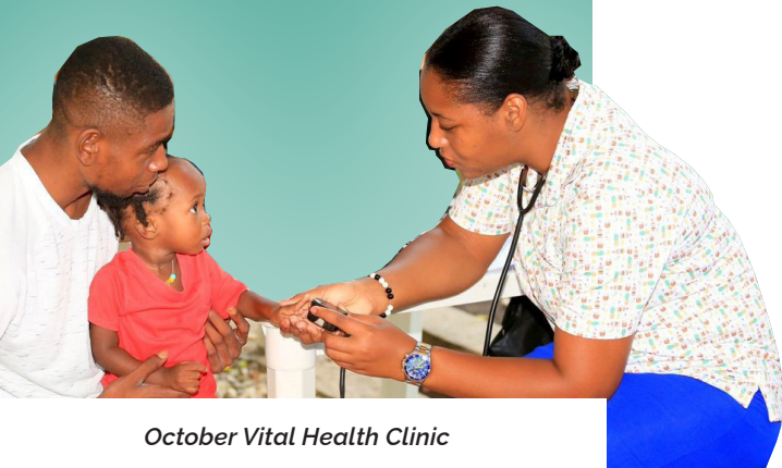
October Vital Health Clinic

NON PROFIT US Postage PAID Peoria, IL Permit #888