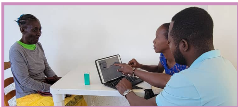
Our providers review a patient's medical history at the Vital Health Clinic

We can track patient trends like scabies, which is currently the #2 complaint from patients, which allows us to proactively order pharmacy supplies and medication.