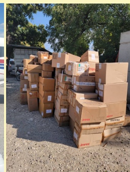
The supplies arrive safely to the clinic

He shares, "Life in Haiti right now is challenged on so many fronts. I live at the clinic full time and I'm always onsite to manage the clinic, and the grounds, and protect our staff and supplies.